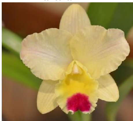
C. Dals Tradition 'Sorcerers Gold'