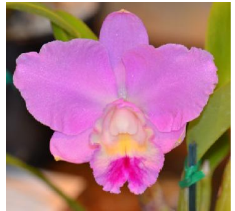
Rlc. Con Harriman 'Perfect Pink'