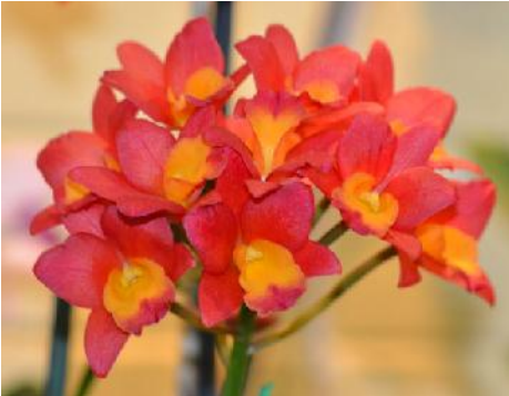
Gct. Dash of Napalm 'Red Bouquet'