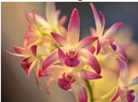
Den. Class 'Pauline'