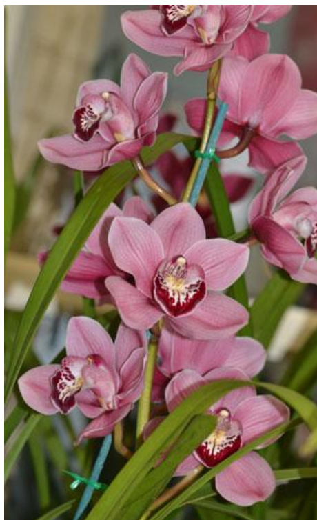
Cym. Wyong Flame