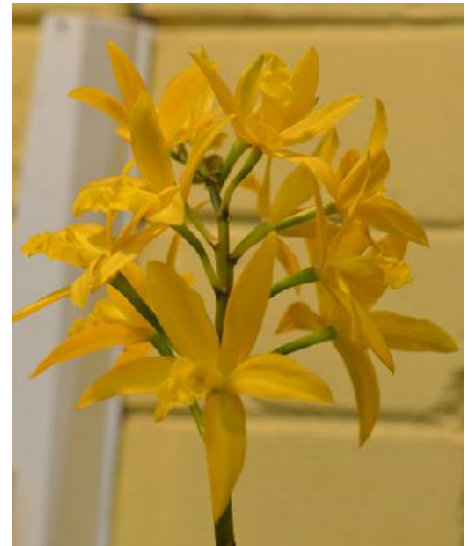
Ctt. Tangerine Dream x C. intermedia