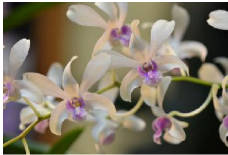
Den. Spellbound x Den. canaliculatum