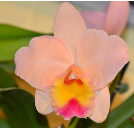
C. Hawaiian Beau 'Michelle'