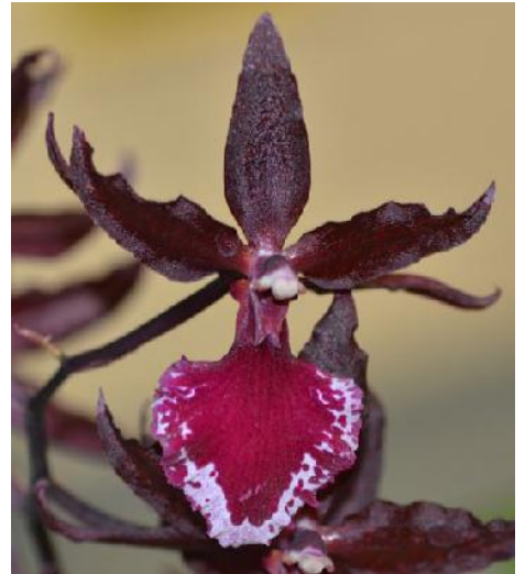
Colm. Massai Red