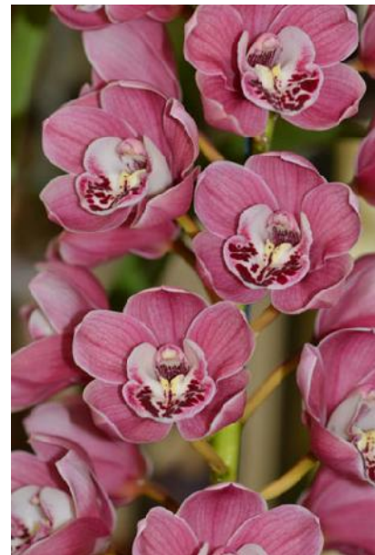
Cym. Akebono 'Dural'