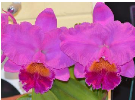
Rlc. Dundas 'Olga'