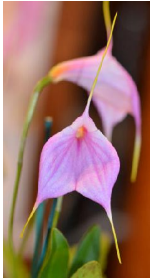
Masd. Bella Donna 'Alicia'