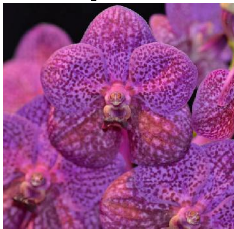
V. Yoo Geck Be 'Lavender Lady'