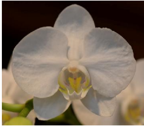
Phal. Aphrodite 'Ben Yu'