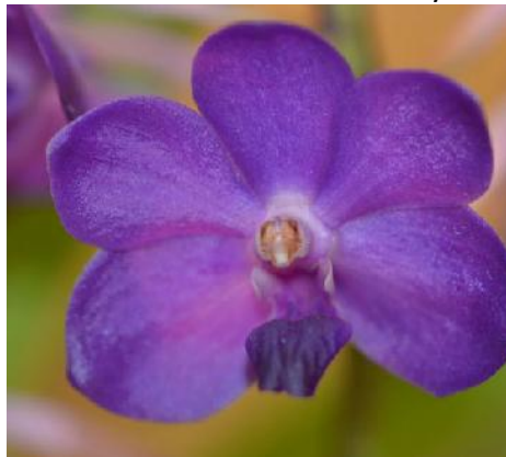
V. Pine Rivers 'Esan'