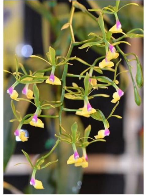
Epi. Rene Marques x Epi. veroscripton