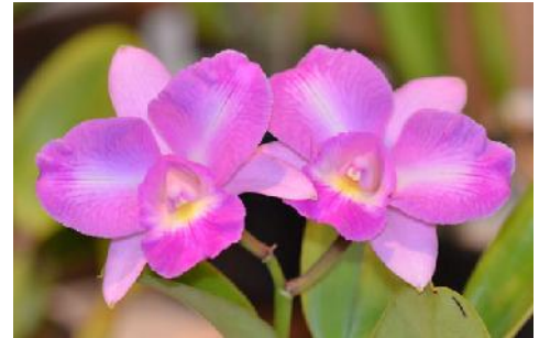
C. Love Hero x C. Petite Pride