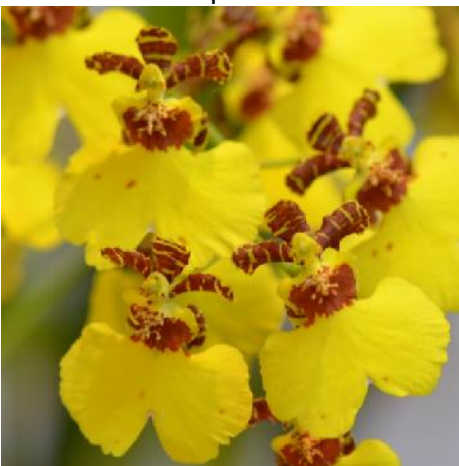
Onc. Gold x Onc. Giowina Gold