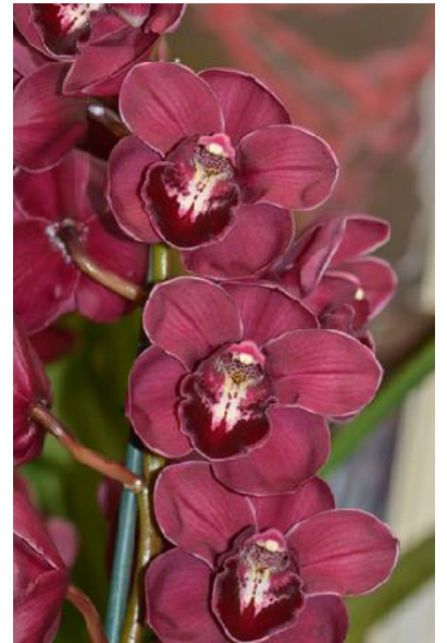
Cym. Regal Flames 'Queen of Hearts'