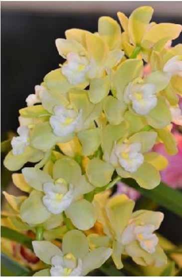
Cym. Pure Sarah