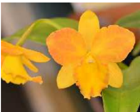
Rth. Free Spirit 'Carmela'