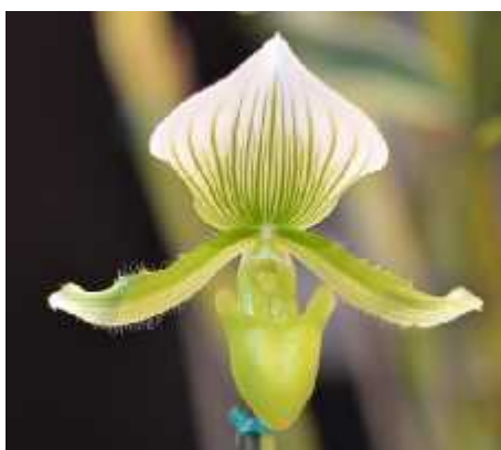
Paph. Clair de Lune 'Edgard van Belle'