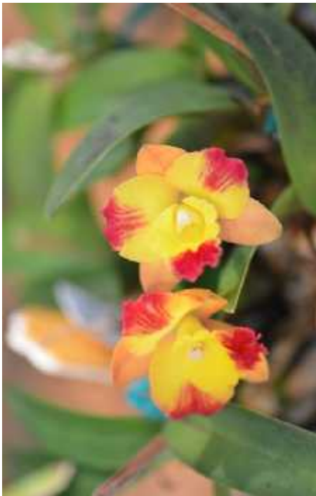
C. Dals Good one 'Janelle'