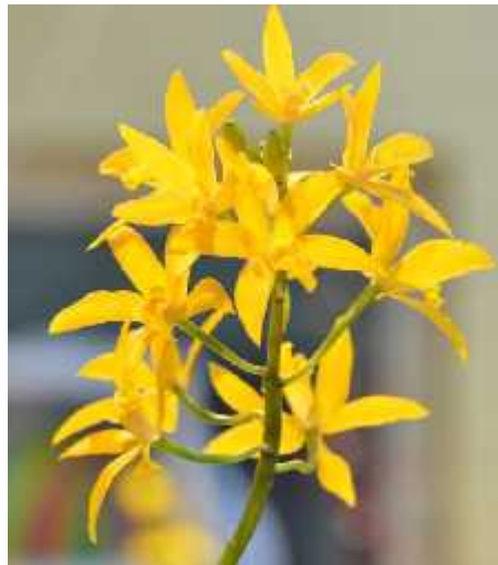
Ctt. Tangerine Dream X C. intermedia