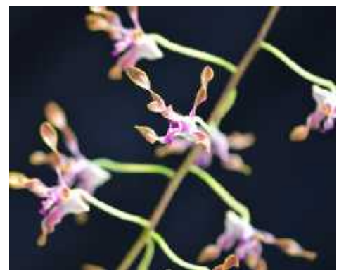
Den. Fraser's Rainbow Twister