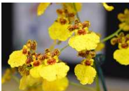
Oncsa. Panache Gold