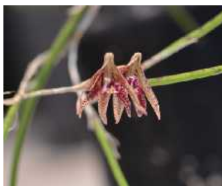
Den. Australian Freckles