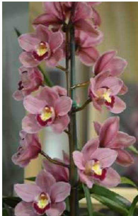
Cym. Lankashire Khan