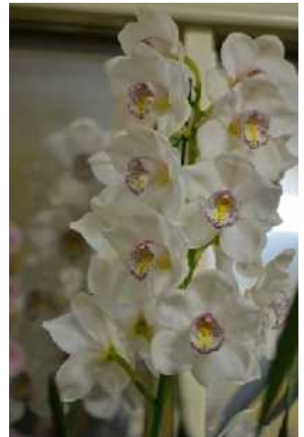
Cym. Poetic Angel 'Kristina'