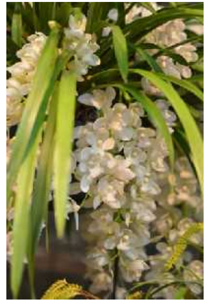
Cym. Sarah Jean 'Ice Cascade'