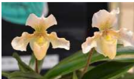
Paph. Rosy Dawn